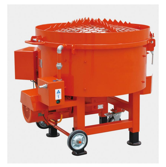
GRM100 & GRM250 Model 100kg 250kg castable refractory mixer