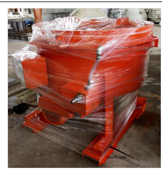
GRM500 Model 500kg castable refractory mixer