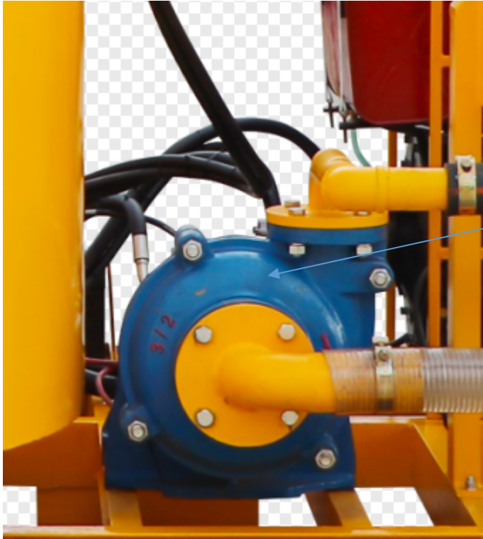
Heavy-duty slurry pump for recirculating and discharging