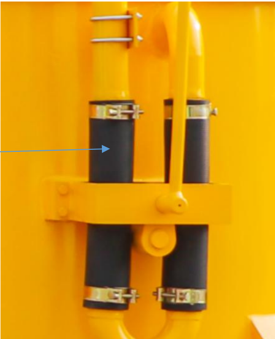
Special design and machining squeeze hose valves with long service life