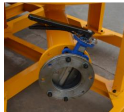
Heavy duty slurry pump; Simple control panel; 5" butterfly valve