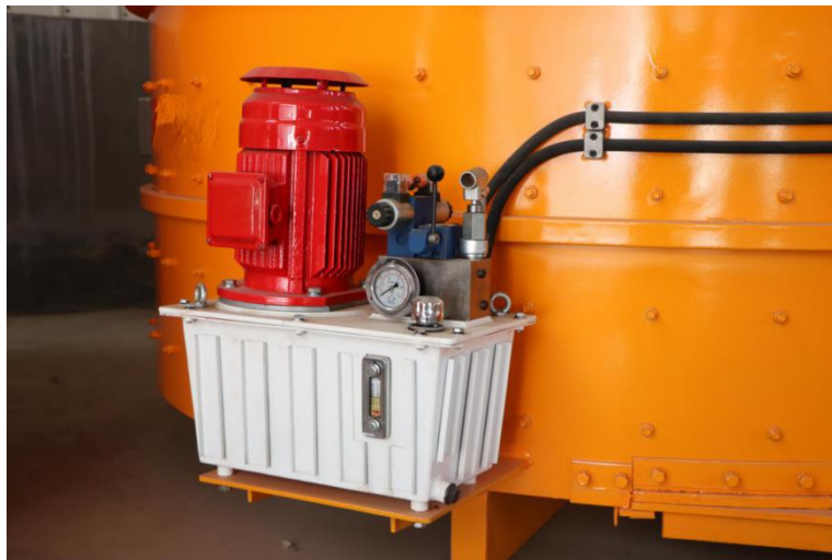
Hydraulic unit equipped with manual pump allows the door be opened in case of electric failure.