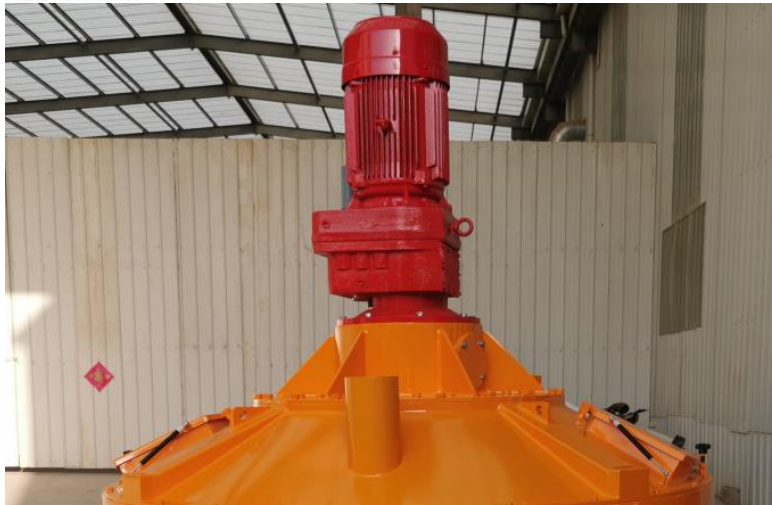
The counter-current gearing system has higher transmission efficiency, excellent mixing result and longer service life