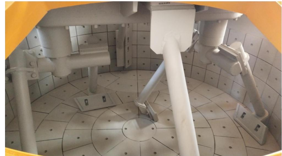
The counter-current mixing device makes the complex mixing locus and high efficient result. The reasonable load distribution of gearing system gives fast and thorough discharging