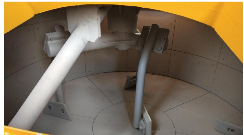
Cr-hard alloy cast iron liner and mixing blade.