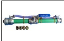
High pressure gun