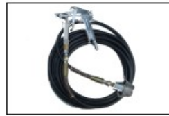
Mixed gas gun