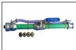
High pressure gun