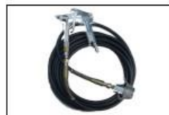
Mixed gas gun