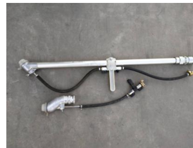
Long & Short Nozzle