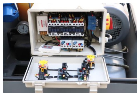
Safe & Independent Electronic Control