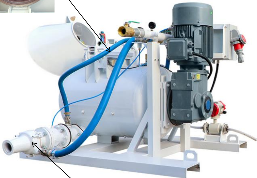
Special swirl adding air design