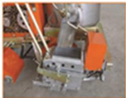
划线斗系列 CHALK LINE SERIES