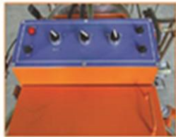
电脑控制面板 COMPUTER CONTROL PANEL