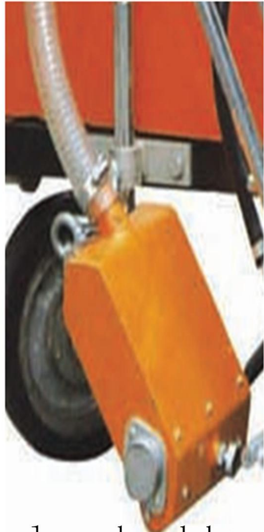
glass bead box