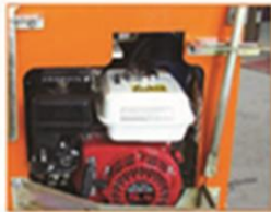
发动机系列 ENGINE SERIES