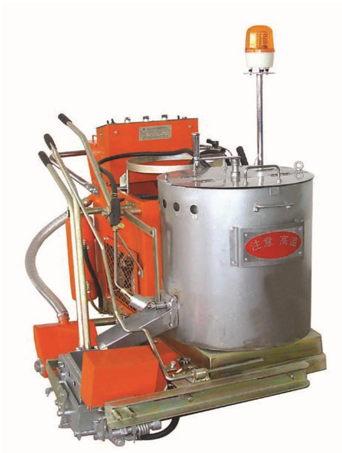
Vibration road marking machine