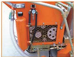
气动系列 PNEUMATIC MACHINE SERIES